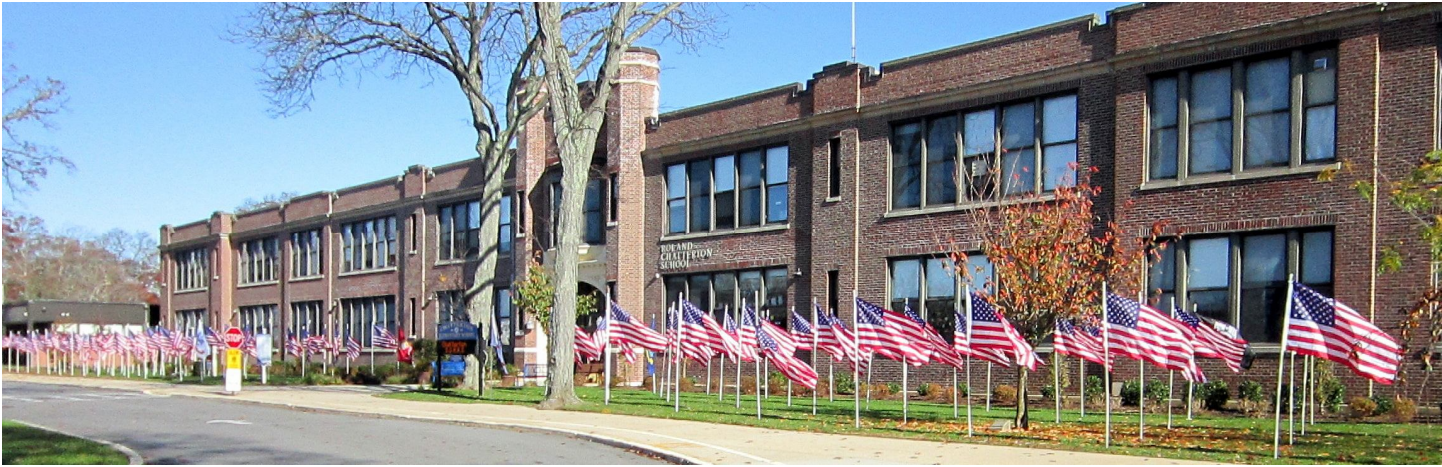
Field of Flags at the Chatterton Elementary School in Merrick, New York; the picture was taken on 11/14/2020.

NON-PROFIT ORG. U.S. POSTAGE PAID MERRICK, N.Y. 11566 PERMIT # 21