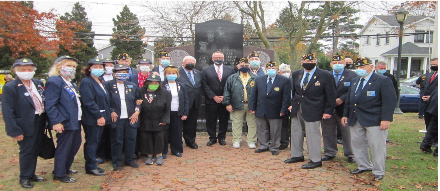
A group picture by the large monument at the Merricks Veteran Memorial Park after the Veterans Day Ceremony 2020. In the picture are American Legion Merrick Post No. 1282 members, American Legion Auxiliary Merrick Unit #1282 members, local area political officials, Freeport/Merrick VFW #1310 members and Jewish War Veterans Ensign L. Soloway Post #652 members